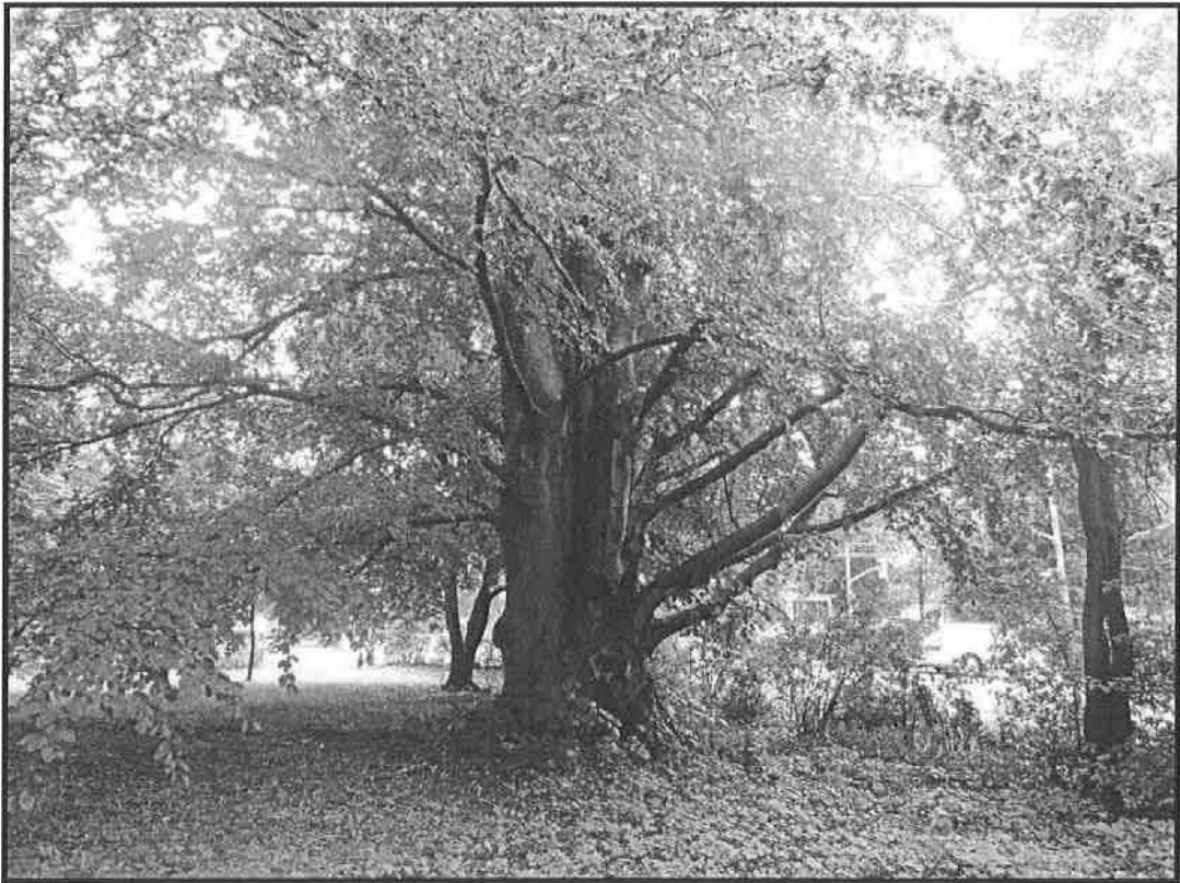
Figure 16. The above image depicts the largest mature tree at 133 Main Street East.