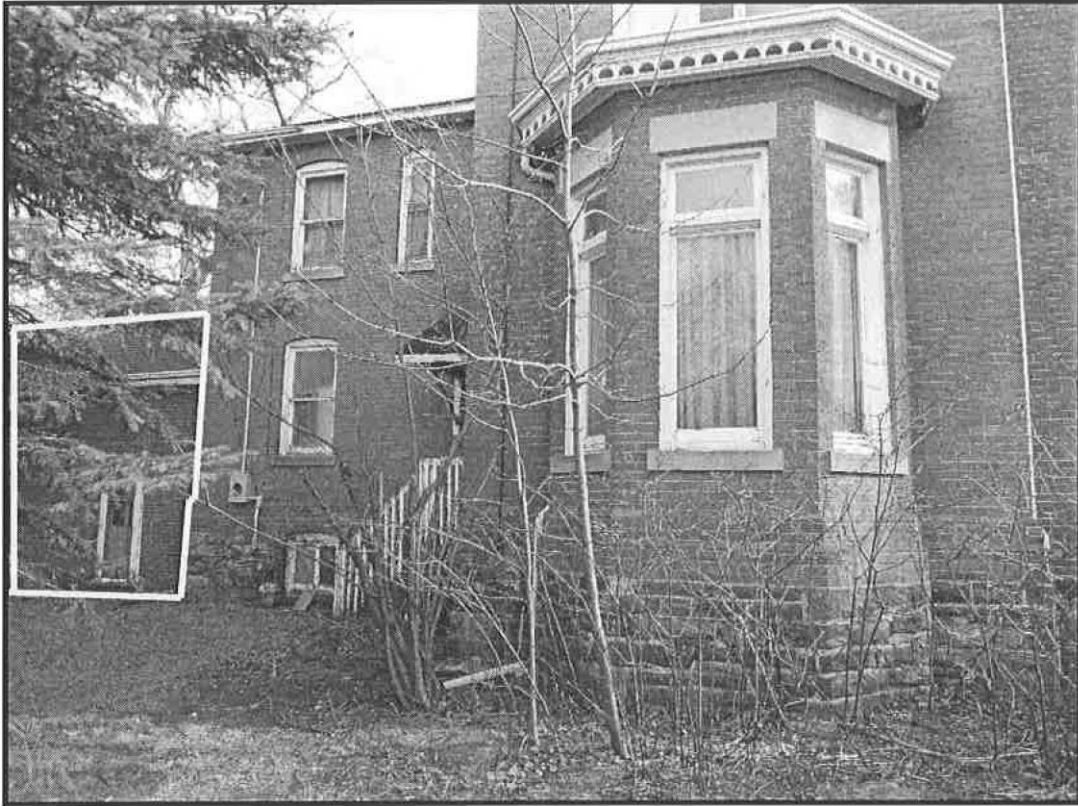
Figure 14. The above image depicts the west elevation of the James Willison Grout Nelles House at 133 Main Street East. Part of a later addition to the dwelling can be seen in the above image which is depicted by the yellow outline. This addition is not included as a heritage attribute to be designated.