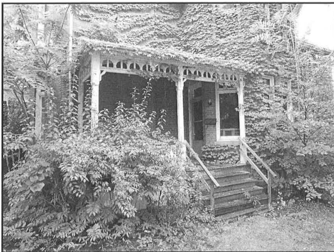
Figure 10. The above image depicts the porch on the east side of the dwelling at the James Willison Grout Nelles House at 133 Main Street East. The original front porch would have likely been constructed in a similar style and of similar materials (wood). The porch exhibits fretwork on the frieze board and small decorative brackets and simplistic pillars.