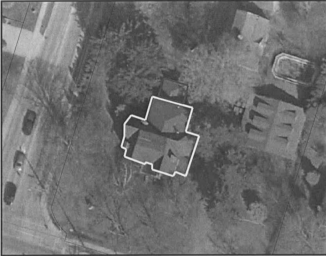
Figure 4. The above image shows the footprint of the original dwelling - indicated by the yellow outline. The portion of the building indicated by the red outline is not part of the original dwelling and does not constitute one of the heritage attributes to be designated