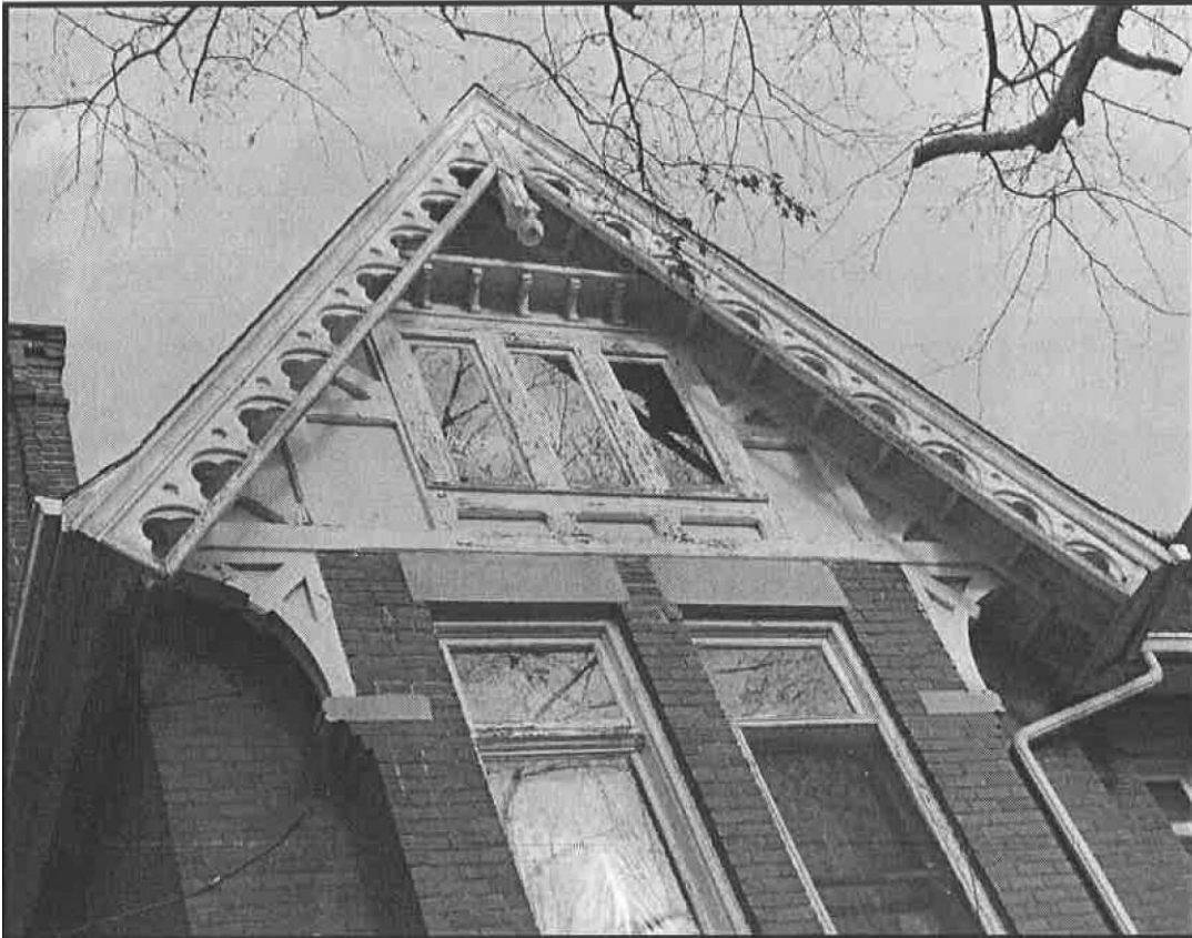
Figure 12. The above image depicts some details of the front elevation of the James Willison Grout Nelles House at 133 Main Street East. The decorative bargeboard with fretwork detailing can be seen as well as the drop finial. Substantial timber brackets are supported by corbelled brickwork and stone. Smaller brackets can be seen under the bargeboard. The gable end is decorated with half timbers that are reminiscent of the stick style that was prevalent in the Queen Anne and Gothic Revival styles of architecture.