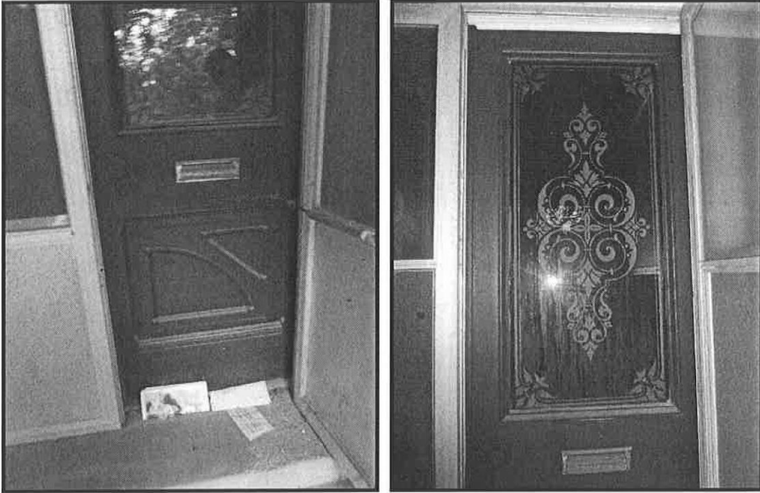
Figures 6, 7. The above images depicts one of the double doors on the front elevation of the James Willison Grout Nelles House at 133 Main Street East. The doors are currently hidden behind storm doors and are likely to be original.