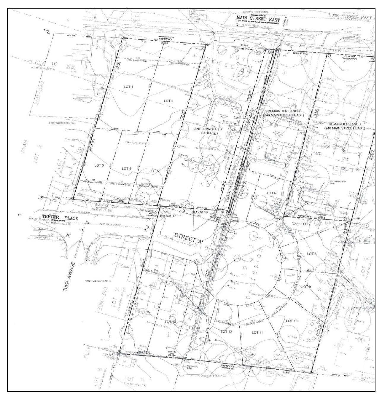
Figure 3 - Proposed Draft Plan of Subdivision