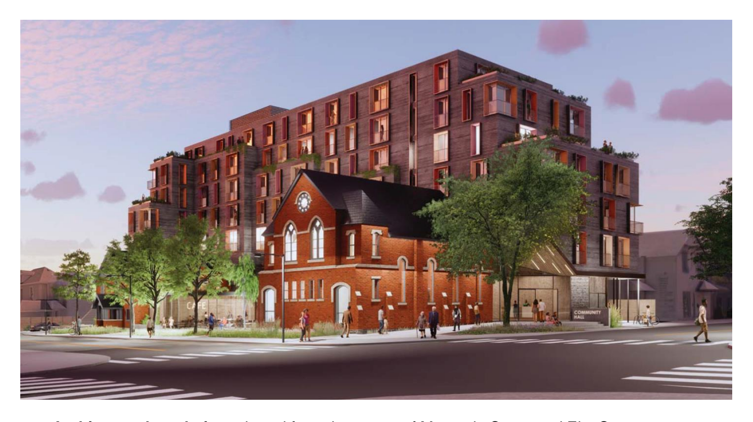
Architectural rendering: viewed from the corner of Mountain Street and Elm Street